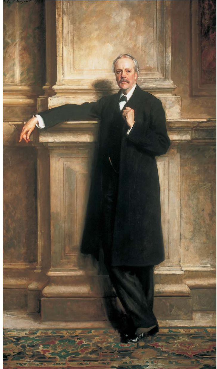
FIG. 7 John Singer Sargent Arthur James Balfour, 1908 Oil on canvas, 256.5 × 147.3 cm National Portrait Gallery, London

Another of the dominating political figures of the age painted by both artists was A.J. Balfour, conservative Prime Minister,