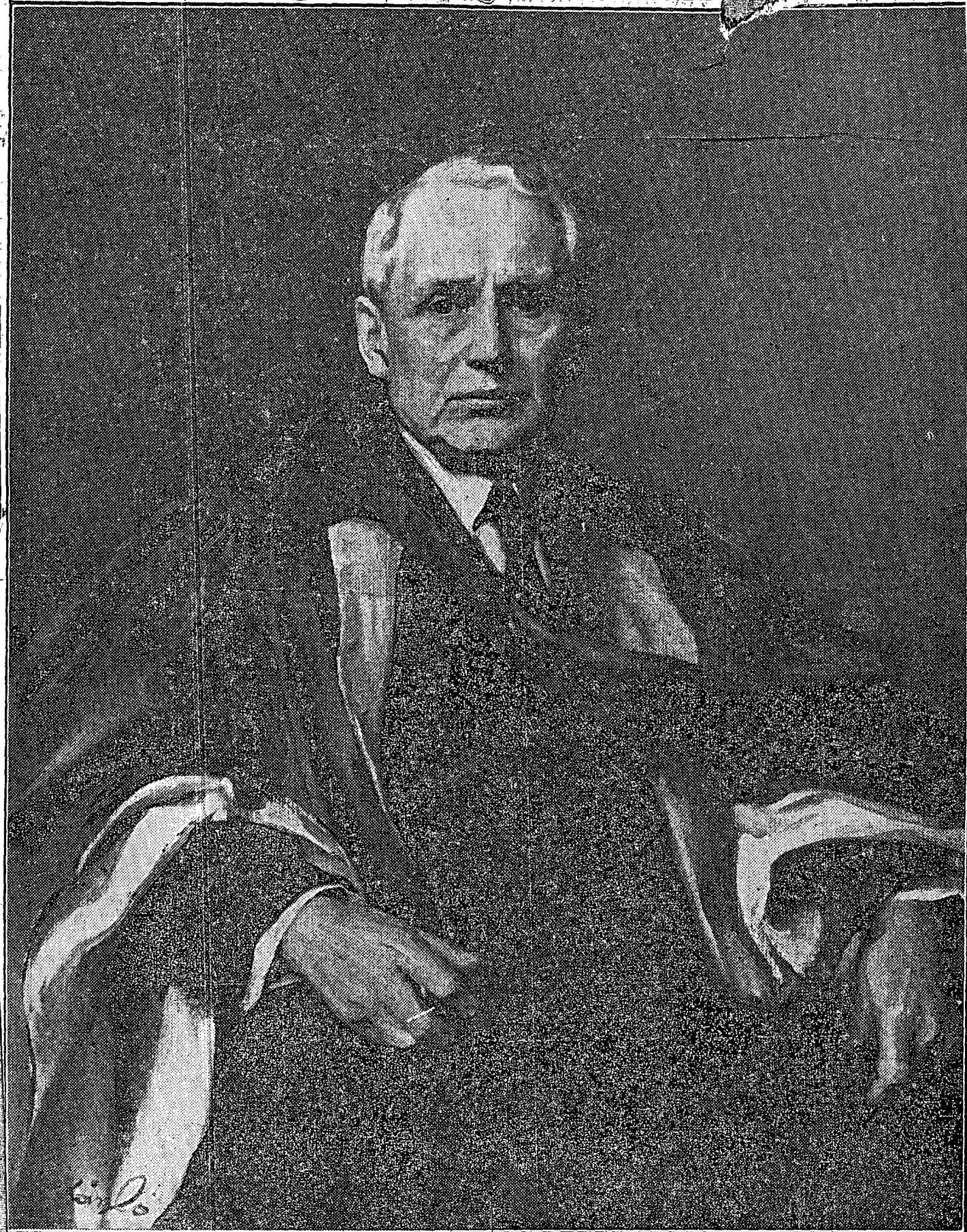
MR. KELLOGG, the retiring American Ambassador, from the portrait by Mr. P. A. de László. He leaves for America tomorrow in the Berengaria to take up in March his new position as Secretary of State in the United States Government.