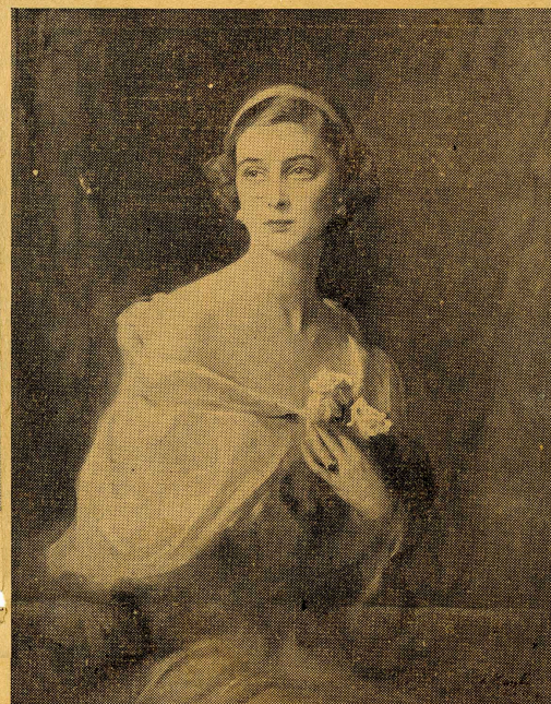
This is Mr. P. A. de Laszlo's portrait of Princess Marina. It will be a wedding present for Prince George. The portrait, with one of Prince George, also by Mr. de Laszlo, will be on exhibition at Knoedler's shortly before the wedding, and the proceeds will be devoted to St. George's Hospital.

Mounted prints from colour reproductions made for a special issue of the "Illustrated London News" will also be sold for the benefit of St. George's Hospital.